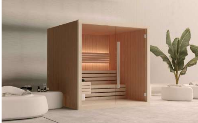
Full glass front or glass window, tempered glass