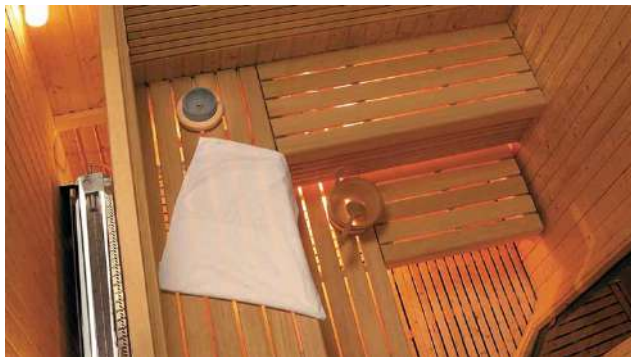
Hidden heater with separation wall