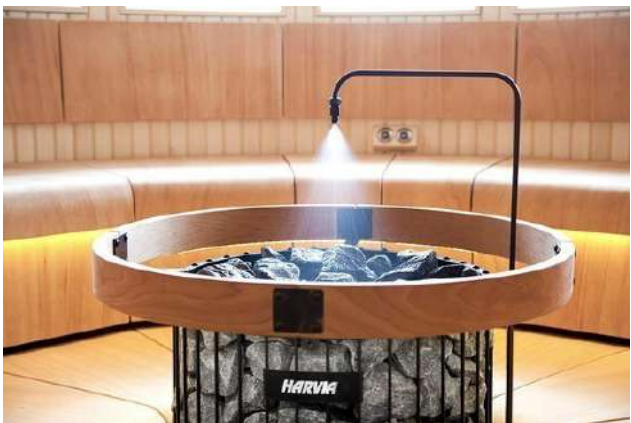
SASL1 Aroma dosing