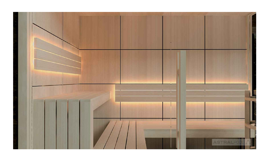
Clear design Wood of great quality Elegant detail