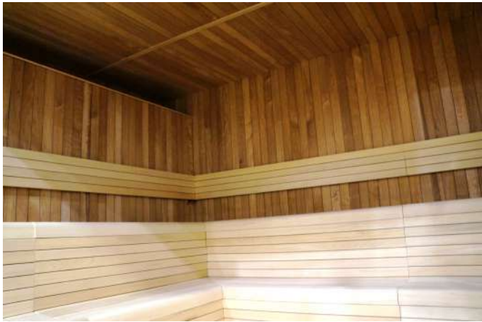
Option: Hidden heater + separation wall with thermal isolation